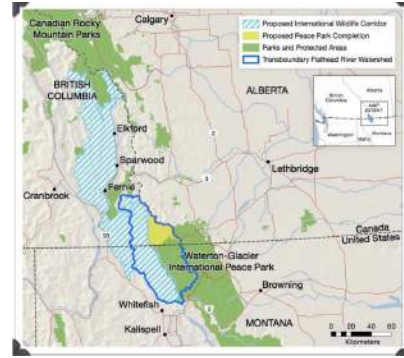
The Flathead Wild! campaign map showing the Waterton Park expansion into B.C. and the Wildlife Management corridor stretching from Banff to Whitefish. (Click here to enlarge map.)