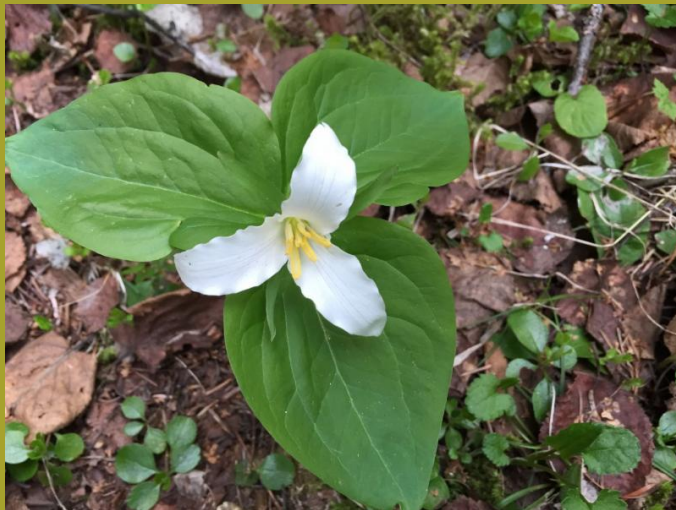
Trillium (Trillium ovatum)

in order to meet the IRS required individual donor match. Will you please donate today!