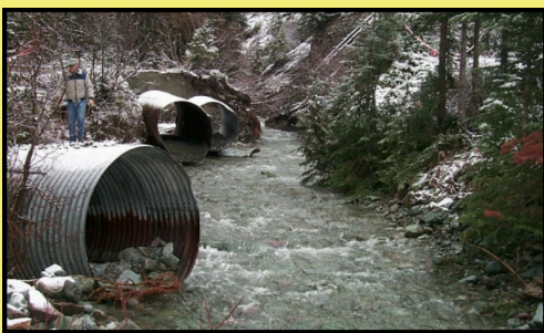
When roads get built in our National Forests, they can create big problems for clean water and fish. Here a culvert has blown out creating a silting problem and a huge cost to taxpayers for repair.

As for the "benefits" of forest road construction and "multiple-use access improvements," these too are imaginary. According to the US Forest Service, they can't maintain the roads they have, and have been closing roads in part to save us - the US taxpayer - money. Closing roads has a big upside: it improves security for wildlife and greatly improves water quality for fish and human consumption, values we can all appreciate.