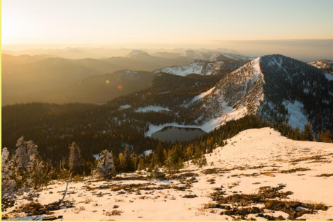
The Ten Lakes WSA - one of the seven Montana study areas on the chopping block in HJ 9.