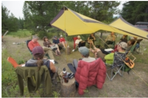
The Flathead Wild Team at Work "Flathead Wild" is the international team that has worked since 2000 to bring permanent protection to the Transboundary Flathead.